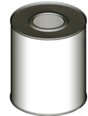
CONICAL DRUM, WITH PLACE FOR PLASTIC INSERT